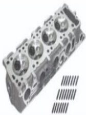
ENGINE CYLINDER HEADS