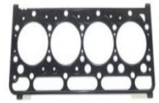
CYLINDER HEAD GASKETS